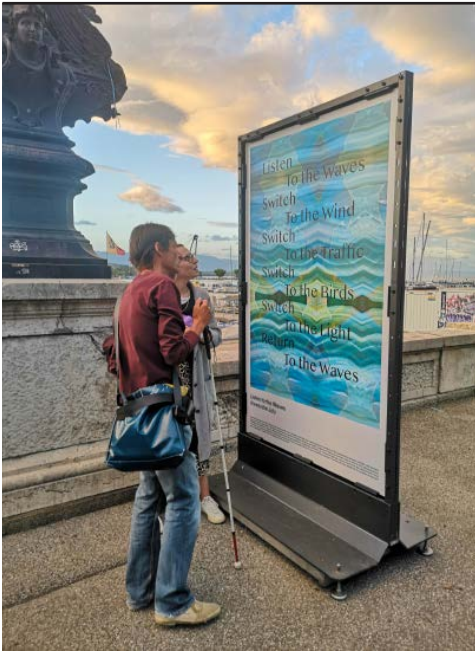
Guided tour of the (re)connecting. earth Biennial (02), 2023.