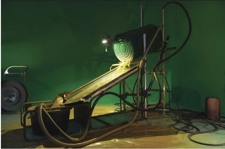
Ana Alenso, The mine gives, the mine takes , 2020. ©Ana Alenso

A view of part of Ana Alenso's installation, which will be on display at the Villa du Parc (contemporary art centre). Other works will be on display at the Comédie de Genève.