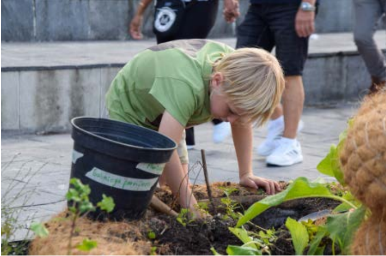
(re)connecting.earth Biennial (02) 2023, botanical workshop.