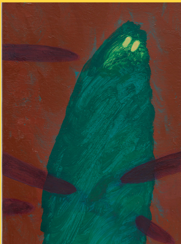
Flo Kasearu, Hedges Having a Row , 2025