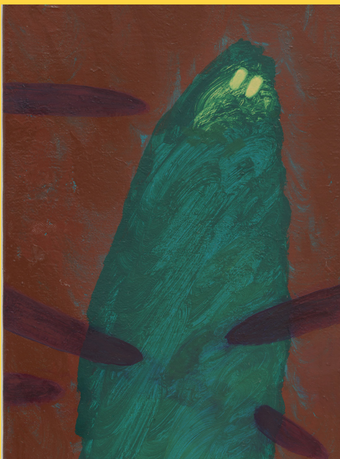
Flo Kasearu, Hedges Having a Row , 2025

Do not step on the grass Solo exhibition