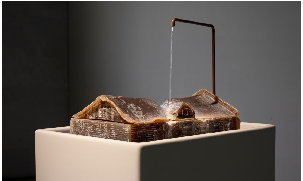
Flo Kasearu, Soap House