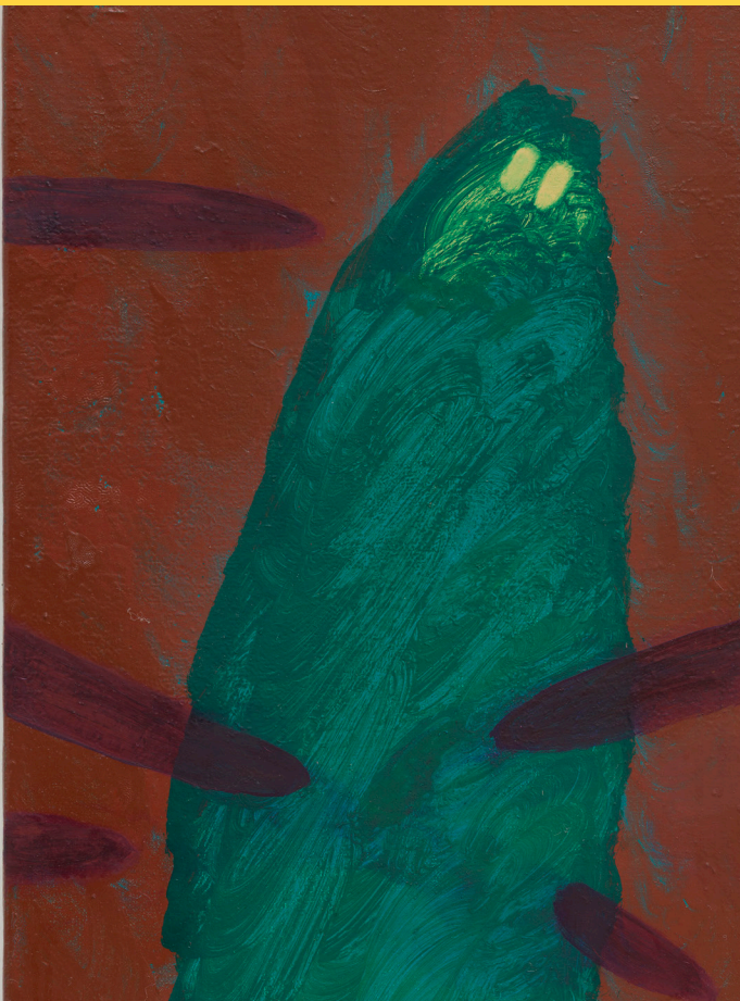
Flo Kasearu, Hedges Having a Row , 2025