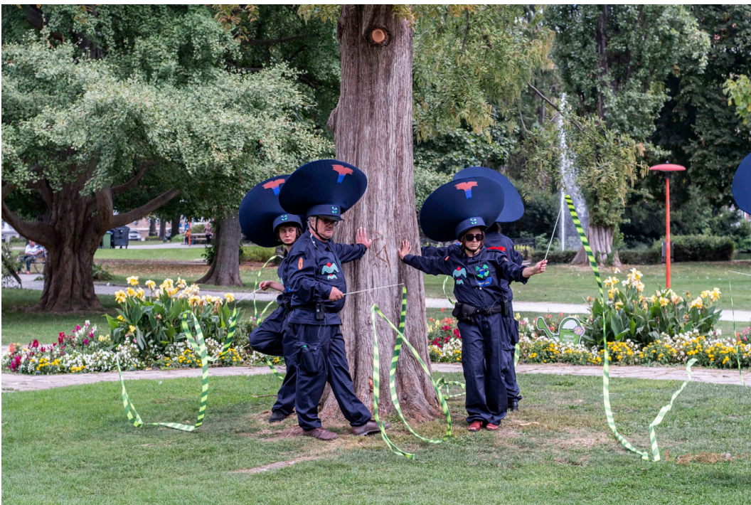
Flo Kasearu, Disorder patrol , 2021