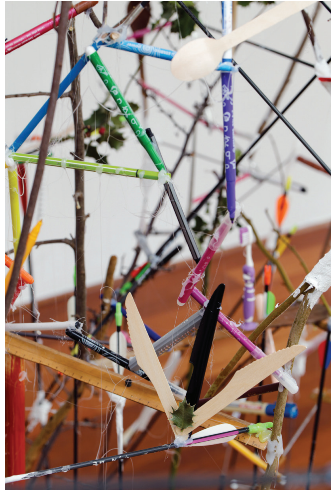
Constellation ordinaire #12 du Parc, 2023