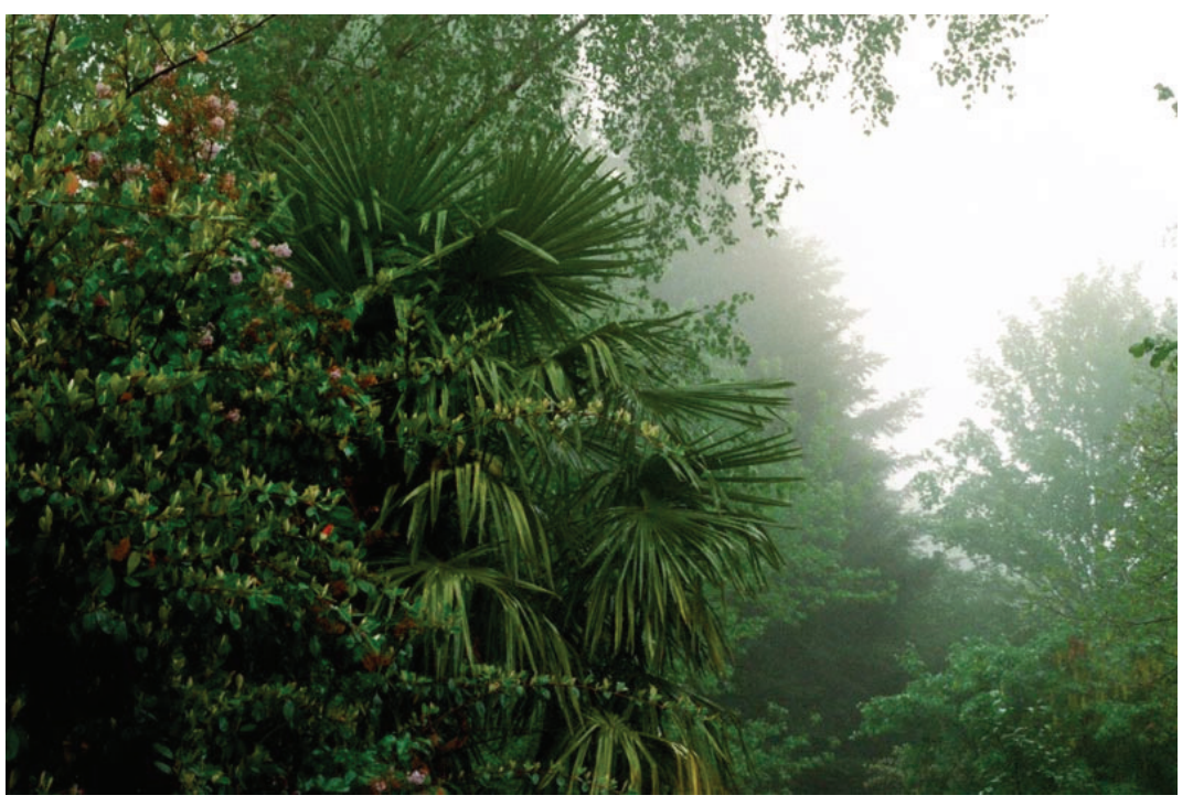
Ludivine Zambon, Laver les pierres , installation photographique, 2022