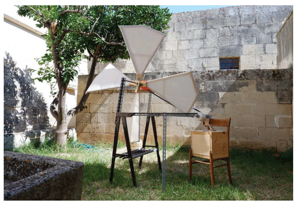
Billy Roch, 2023