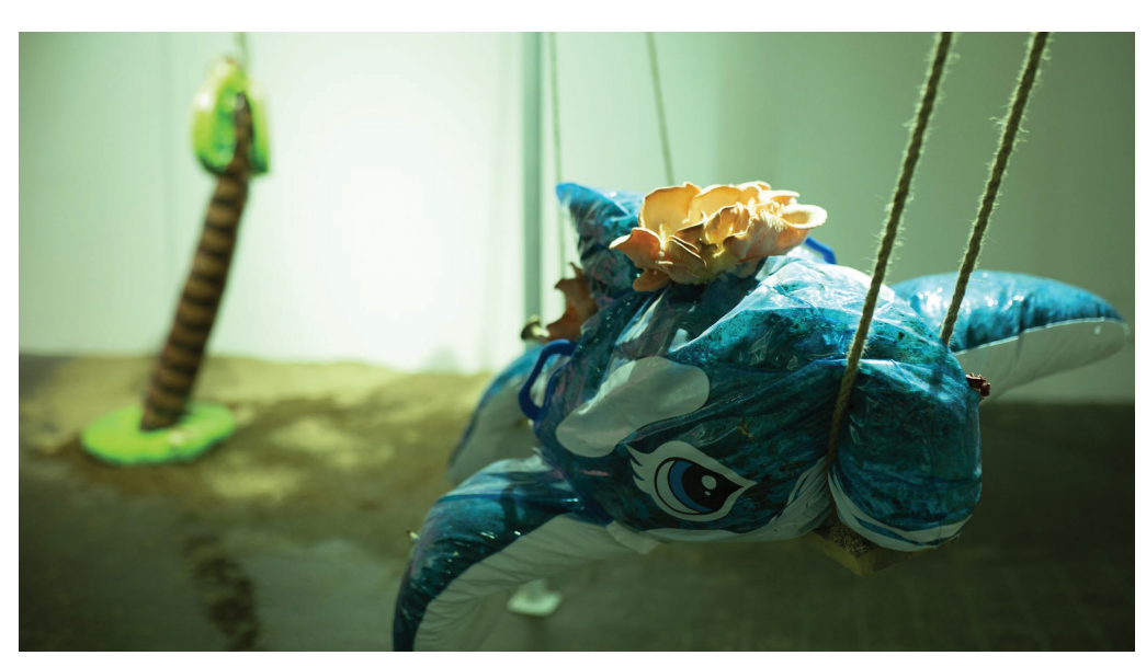
Yael Kempf, Missile, 2019