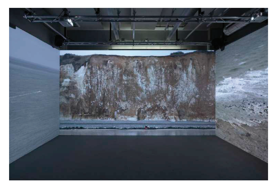
Eliot Ruffel, Ca nous rend plus vivant, 2021