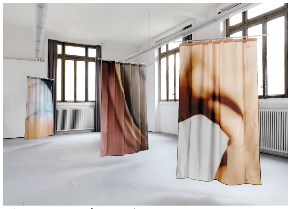
Neige Sanchez, A Room for Abstraction, 2021