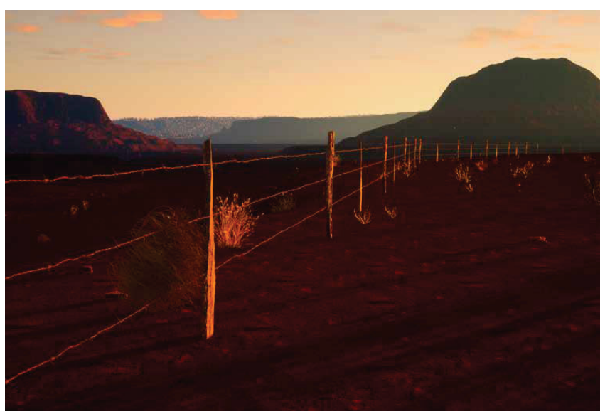
Tanguy Benoit, capture d'écran du Jeu vidéo, 2021