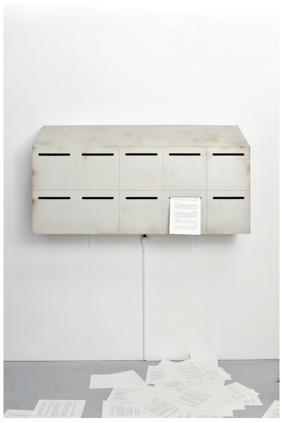
Julien Fournival, Dans le dos face au jardin , 2024, crédit photo: Zoé Aubry