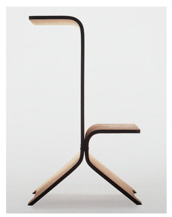
Félix Léon, Valet, 2020