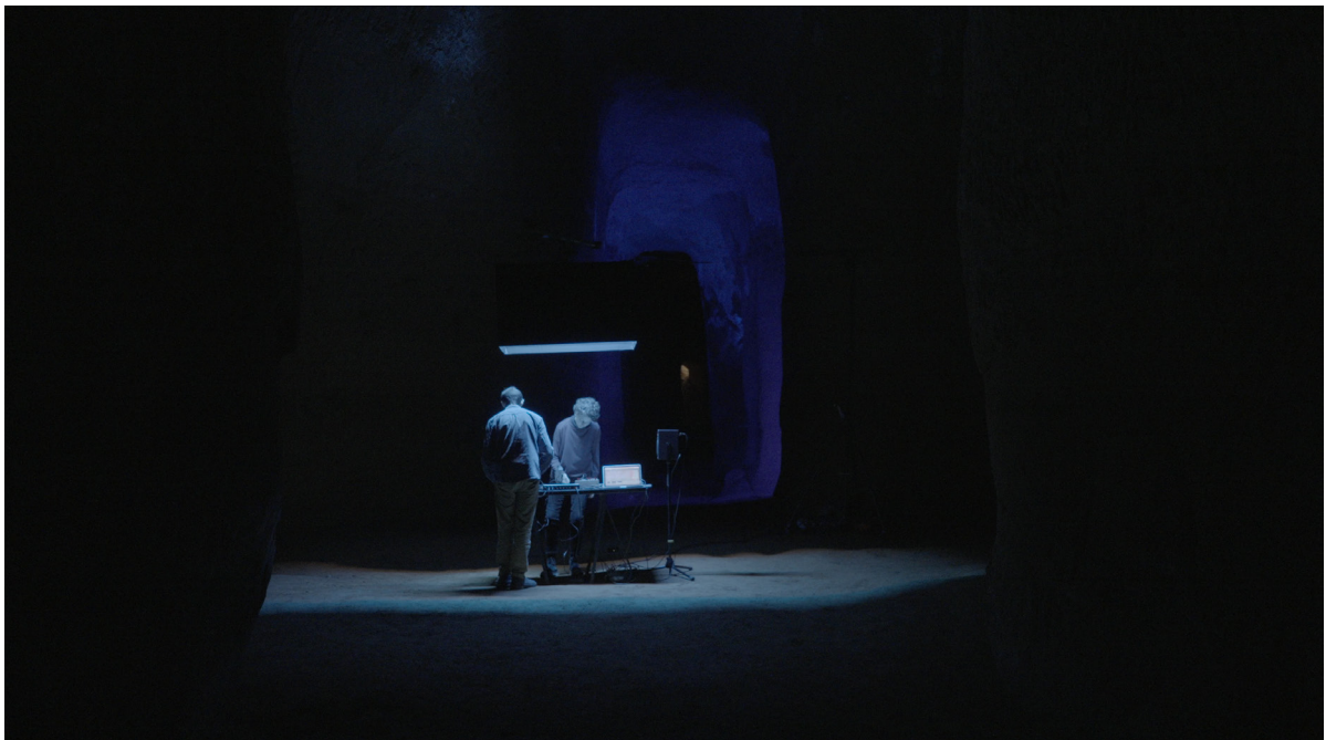
Film still from The Analogue Tracks , Florent Meng Lechevallier, 2023