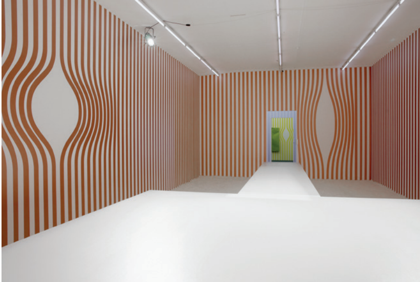
Sylvie Fleury, The Eternel Wow, 2005, ©Ilmari Kalkkinen

informations and pictures on request: communication@villaduparc.org